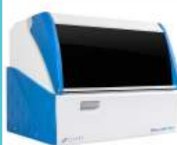
Fully Automatic Elisa / IFA Analyzer