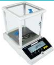
Digital Precision Scale