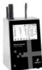
Remote Airborne Counter